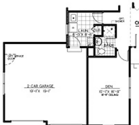
OPT 2 CAR WITH DEN