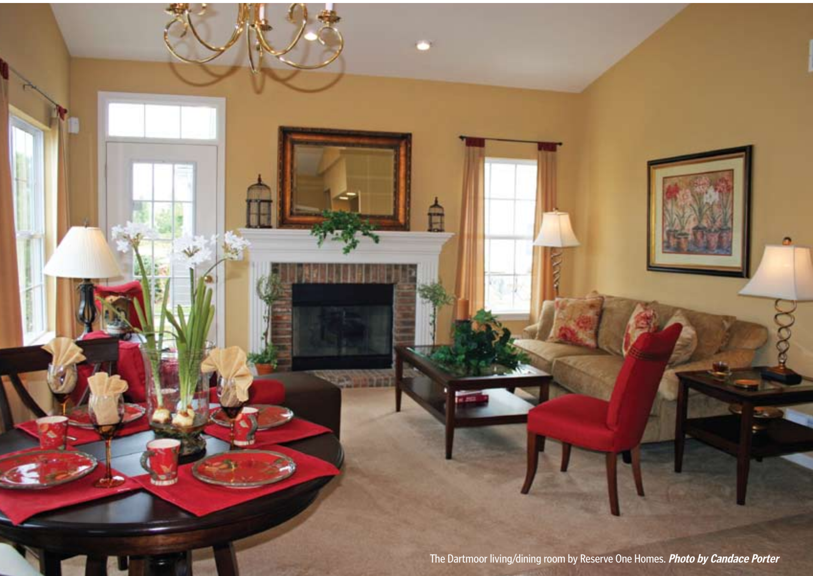
The Dartmoor living/dining room by Reserve One Homes.

• Compact fluorescent light bulbs (CFL) (high-efficiency light bulbs reduce your home's electric bill and last longer)