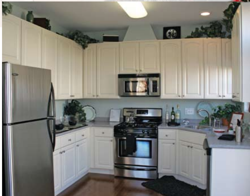
The Andalusion kitchen by Reserve One Homes.

much energy when you’re away or sleeping)